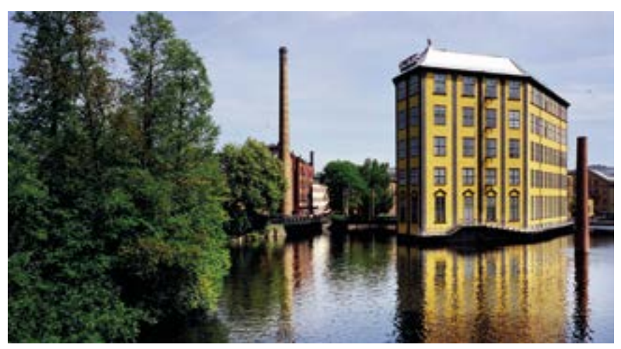
The Museum of Work in Norrköping.